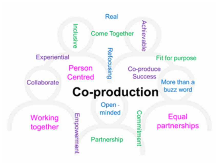
Word cloud created with the words of the Making it Real Shropshire Board

Website: www.shropshire.gov.uk/shropshire-choices/caring-for-someone-else/