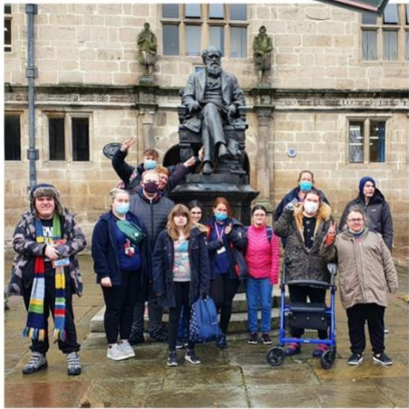
Walk into town.