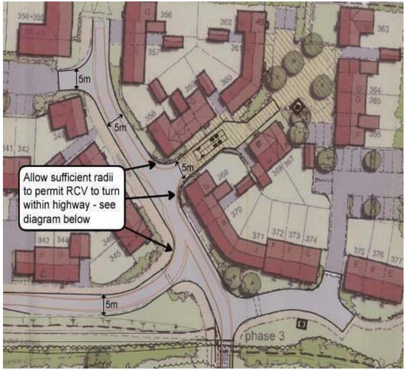
Example vehicle tracking plan. Orange lines indicate vehicle route